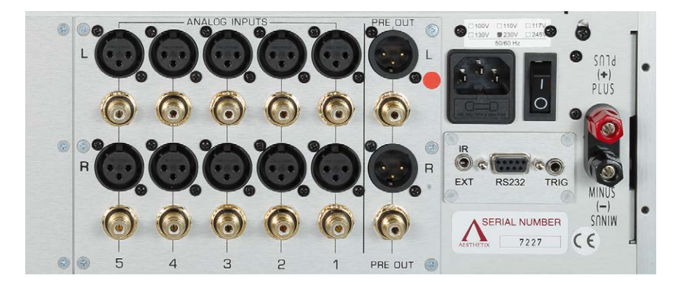
▲ Endstufensektion links und rechts, fünf Eingänge und ein Pre-Out jeweils in Cinch und XLR, Einschuboptionen für DAC und Phonoboard – ein pralles Ausstattungspaket

◄ Instead of the conventional, externally made toroidal transformer, Aesthetix uses a homemade one.